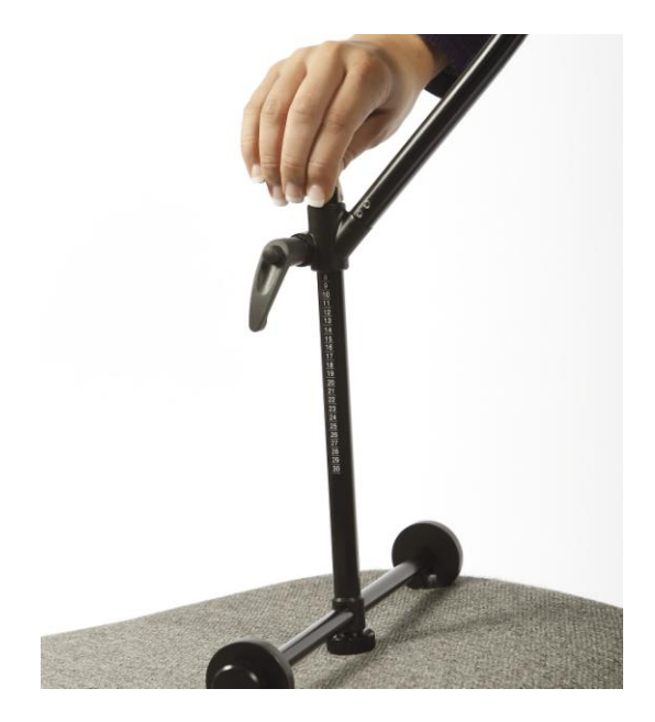
To remove the vertical tube press on the two spring loaded locking tabs while pushing the T-bar down into the support arm Y.

To attach the T-bar to the support arm simply push it into the support arm Y.