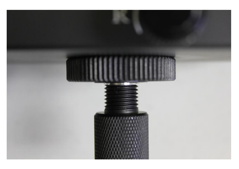
The maximum extension for the gimbal extender is shown at left. When you just begin to see the shiny thread cutout it means DON'T GO ANY LOWER.